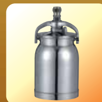
GOL-1104 1000 C.C Alu Cup