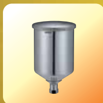
GOL-1102 125 C.C Alu Cup