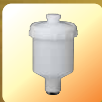
GOL-1101 125 C.C Nylon Cup