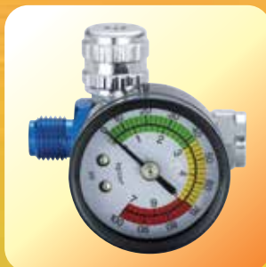
GOL-1111 Air Regulator W / Guage