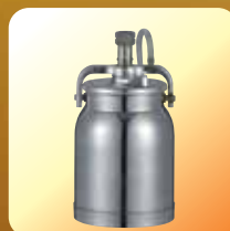
GOL-1103 1000 C.C Alu Cup