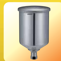
GOL-1106 600 C.C Alu Cup