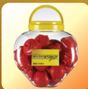
GOL-1116/1 Disposable Filter 20 PCS / BOX