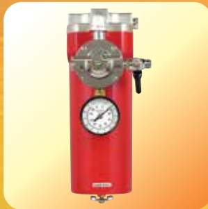
GOL-3601 Air Filter W / 1 Guage