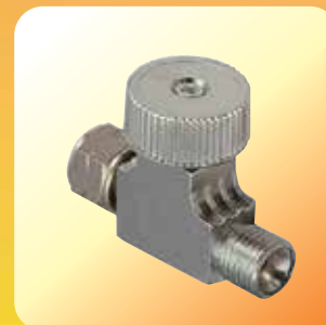
GOL-1112 Air Regulator