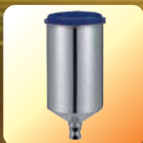
GOL-1107 1000 C.C Female Alu Cup