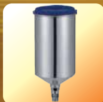
GOL-1107M 1000 C.C Male Alu Cup