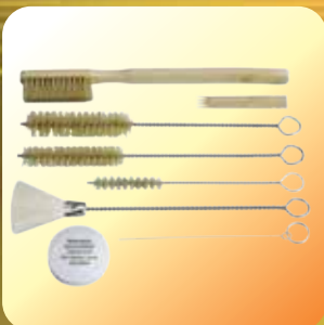
GOL-1110 12 PCS Cleaning Kit