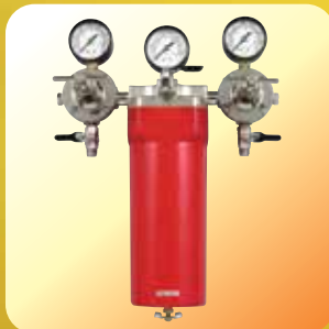
GOL-3603 Air Filter W / 3 Guage