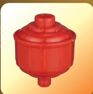
GOL-1116 Disposable Filter 2 PCS / SET