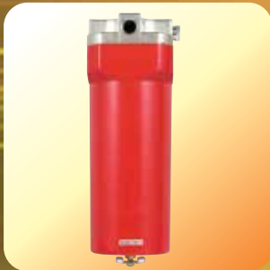
GOL-3600 Air Filter