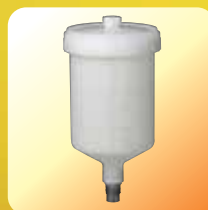
GOL-1105M 600 C.C Male Nylon Cup