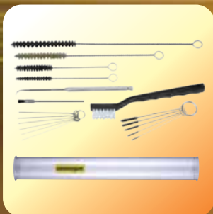
GOL-1118 18 PCS Cleaning Kit