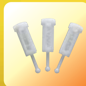
GOL-1115 Gravity Feed Filter