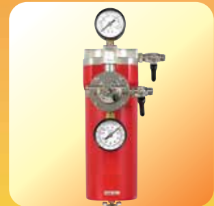
GOL-3602 Air Filter W / 2 Guage