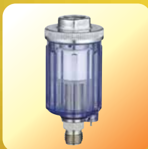
GOL-1114 Water Separator