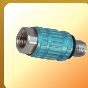
GOL-1117 Air Regulator