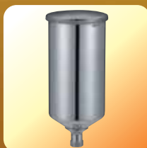
GOL-1108 1000 C.C Alu Cup