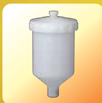
GOL-1105 600 C.C Female Nylon Cup