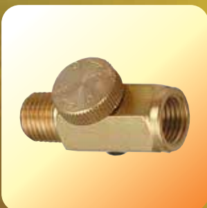
GOL-1113 Air Regulator