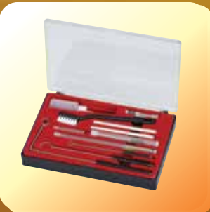
GOL-1122 22PCS Cleaning Kit